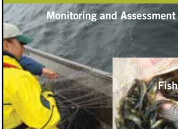
Monitoring and Assessment